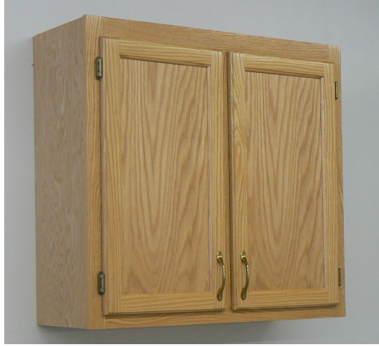
Figure 21.3 – Cabinet Pulls